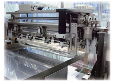
High Precision Doctor Blade System