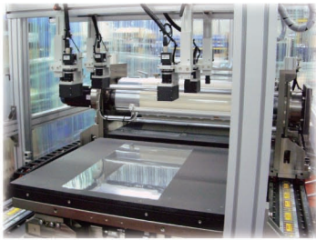
High Precision CCD Alignment System