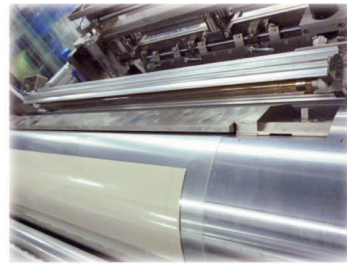
IR Curing System