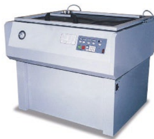
Exposing Machine HA-SE-2