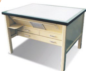
Registration Light Table