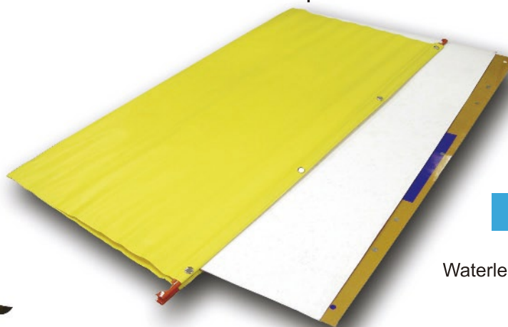
Waterless plate cover