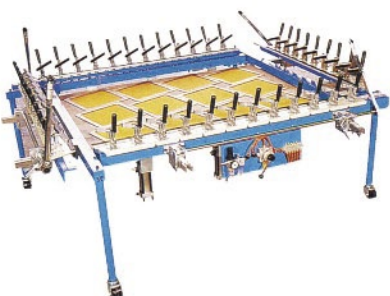
Mechanical Screen Stretcher HA-ST-2