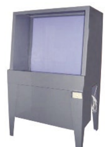
Developing Cabinet HA-DC-2